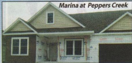
Marina at Peppers Creek

This gorgeous Twin is located at The Village a of Cinderberry, 50+ Community in Georgetown, DE this twin features 2 floor plans..a 2 bedroom, 2 bath, 2 car garage, or a 3 bedroom, 2 bath, 2 car garage. Includes fireplace, corian kitchen tops, maple cabinets, tile Master Bath & walk in Showers ...just pending sod & irrigation, and it will be move in ready!