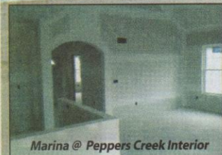
Marina @ Peppers Creek Interior

Refer a friend to LBG Homes and receive $1,000 cash! Must sign contract. Cash awarded at pouring of foundation.